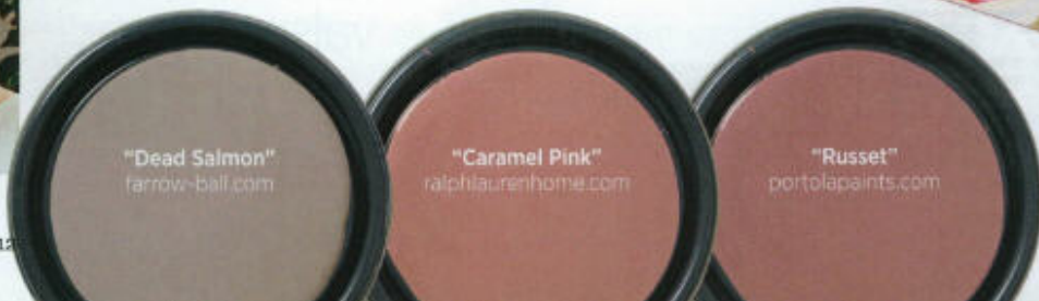
"Dead Salmon" farrow-ball.com