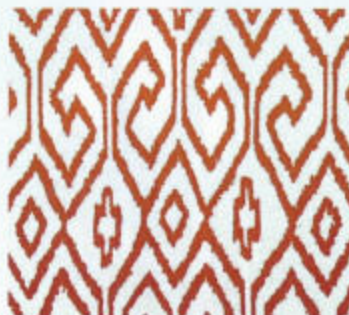
"Aqua 4" in rust from China Seas quadrillefabrics.com