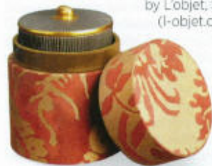
Porcelain and fabric Fortuny Red Candle by L'objet, $125 (l-objet.com)