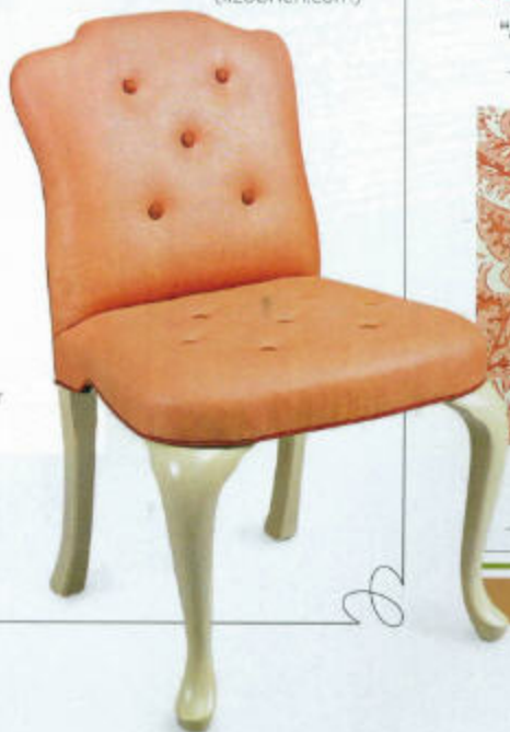
"Frances" side chair by Liz O'Brien Editions ( lizobrien.com )