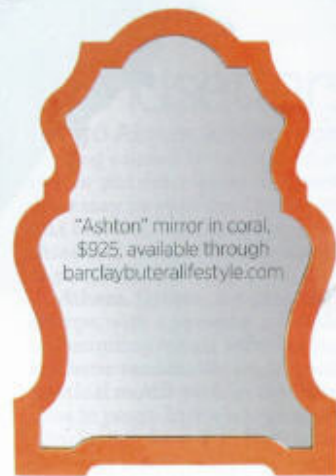
"Ashton" mirror in coral, $925, available through barclaybutlerallifestyle.com