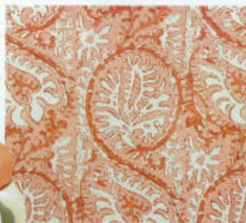
"Grand Shangri-La" in coral johnrosselliassociates.com