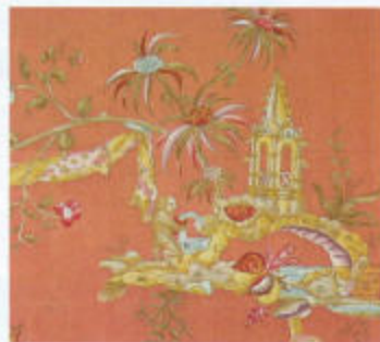
"La Pagode Chine" in cayenne cowtan.com