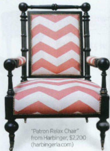
"Patron Relax Chair" from Harbinger, $2,200 (harbingerla.com)