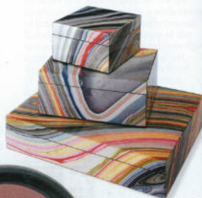
Lacquer boxes from Mitchell Gold + Bob Williams, $85-$135 (mgbwhome.com)